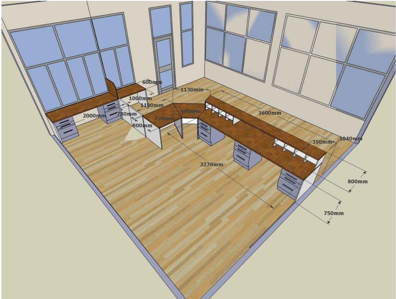
Figure 2. Counter Top & Draw units